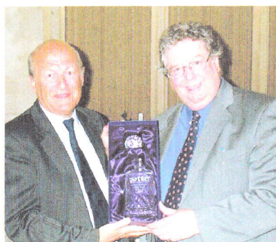
2.9.00 - ETTA Male Coach of the Year