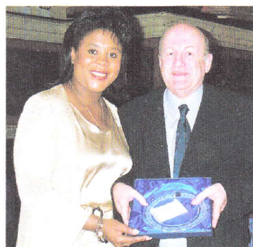
16.2.01 - NCF Volunteer Coach of the Year