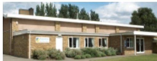
.. last look at the building as it once was!!

Sat 4th 11:00am British League Div 1S & 2S/M (1) Sun 5th 10:00am British League Div 1S & 2S/M (1) Sat 11th 9:00am Buckinghamshire Junior Trials Sun 12th 10:30am Southern Region Junior Training Sat 18th 9:00am Southern Region Preliminary Trials Sun 19th 9:00am Southern Region Preliminary Trials Sat 25th 10:30am Southern Region Coaches' Get-Together